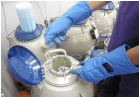
[Picture Credit: Cryopreservation]

Cryopreservation of human spermatozoa - introduced in the 1960's - has been recognised as an efficient procedure for management of male fertility before therapy for malignant diseases, vasectomy or surgical infertility treatments, to store donor and partner spermatozoa before assisted reproduction treatments and to ensure the recovery of a small number of spermatozoa in severe male factor infertility.