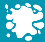
Squamous cell carcinoma